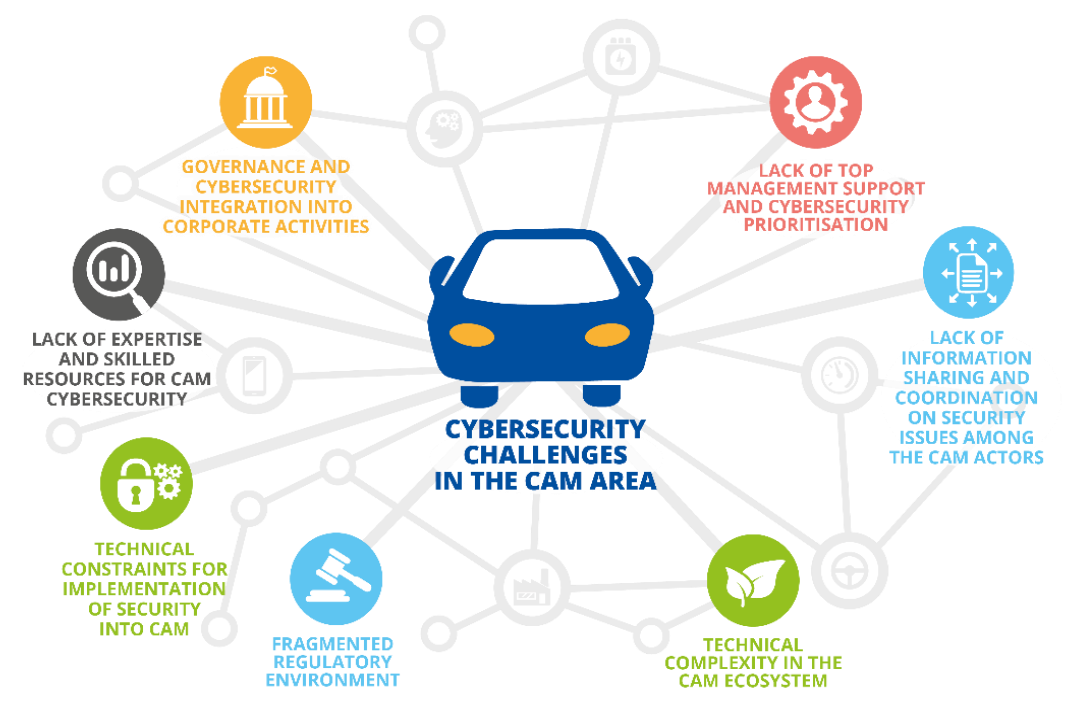
Figure 1: Cybersecurity Challenges in the CAM area

Using a layered approach of primary and secondary research, this report summarises insights across a complex CAM ecosystem. Primary research methods included a survey and a series of interviews and validation discussions with key stakeholders from the CAM ecosystem. Secondary research methods included desktop research of works of ENISA, official statistics, academic research, external studies and official documents, white papers, legislation, policies, strategies and initiatives to identify challenges and lessons learnt on cyber incidents against the CAM ecosystem.