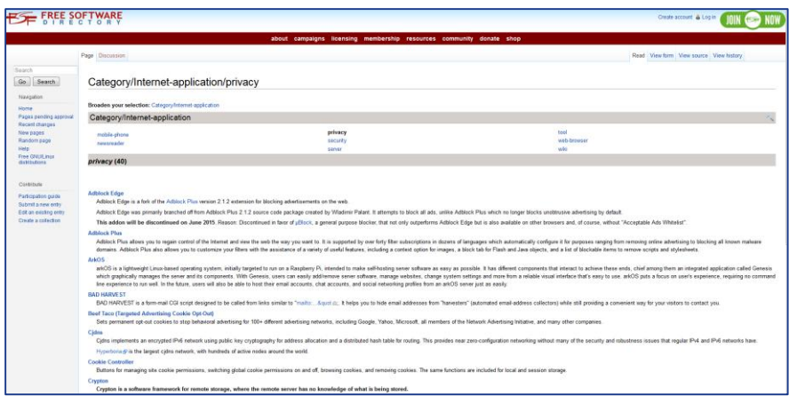
Figure 6: FSF Free Software Directory

The Free Software Foundation (FSF) is a non-profit organization with a worldwide mission to promote computer user freedom and to defend the rights of all free software users.