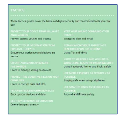
Figure 3: Security in-a-box

The site provides classifications for Windows and Android. The evaluation criteria, located at the About section include items such as if the tools are trusted (i.e., audited independently or anecdotal), matured (stable, with an active user-base community or a responsive developer community), open source or free, user friendly, multi-language, multi-platform, or if there is documentation available (source code, installation guides, usage notes, updates, etc.). Besides, the site references other similar projects promoting the use of privacy tools.