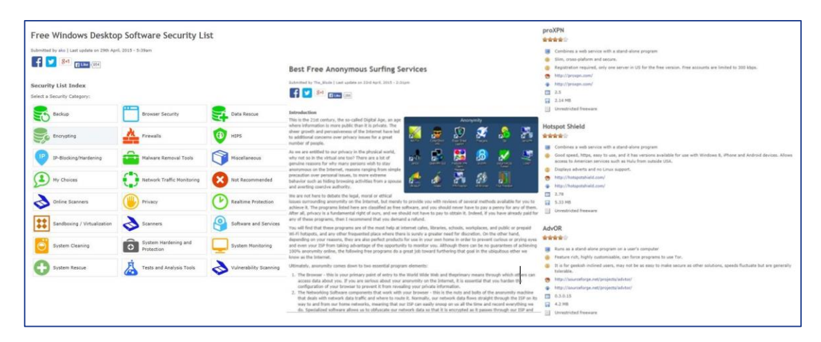
Figure 9: Gizmo's freeware

Gizmo's Freeware is a non-commercial community website composed of volunteers. Their goal is to help users select the best freeware products for a wide range of uses. Its staff is composed by volunteers with no commercial affiliations. Interested readers can contribute with short tips, how-to guides, tutorials or products reviews. In order to do that, it is necessary to register in the system, to send a proposal and to wait for its acceptance.