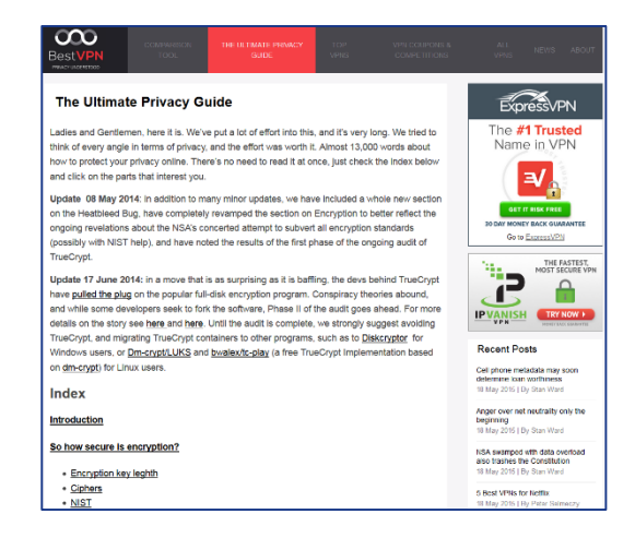
Figure 5: Best VPN Ultimate Privacy Guide

BestVPN is a site created by 4Choice Ltd, a company located in the UK, and offers a review of over 50 VPN providers (most of them non-free). In addition to that, the site maintains a web page, The Ultimate Privacy Guide<sup>32</sup>, which contains a list of privacy tools classified by areas.