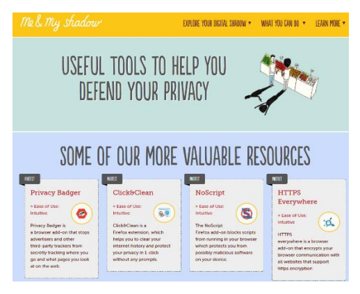
Figure 8: Me & My shadow

Me & My Shadow<sup>35</sup> is a project created in 2012 that helps to understand the concept of digital shadows, supporting users to minimise them. The site is maintained by Tactical Technology Collective, an international organisation dedicated to the use of information in activism (see also Security-in-a-box).