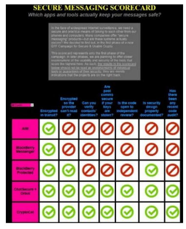
Figure 1: EFF Secure Messaging Scorecard