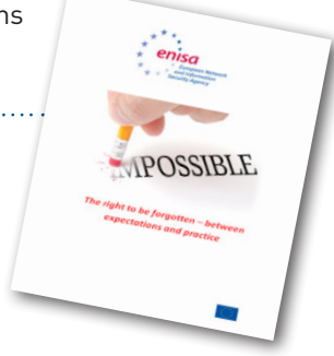
continued on page 2

a further need for clear definitions and legal clarifications.