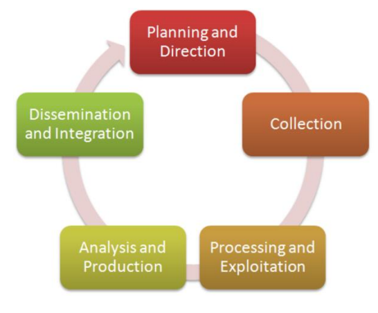
Figure 3: Intelligence cycle

Based on the literature [17], a need has been identified to investigate and define how threat intelligence sharing platforms can address different activities within the intelligence cycle model [74]. In this section, a set of properties enabled by TIPs is provided per intelligence cycle phase as Functional Areas (FA).