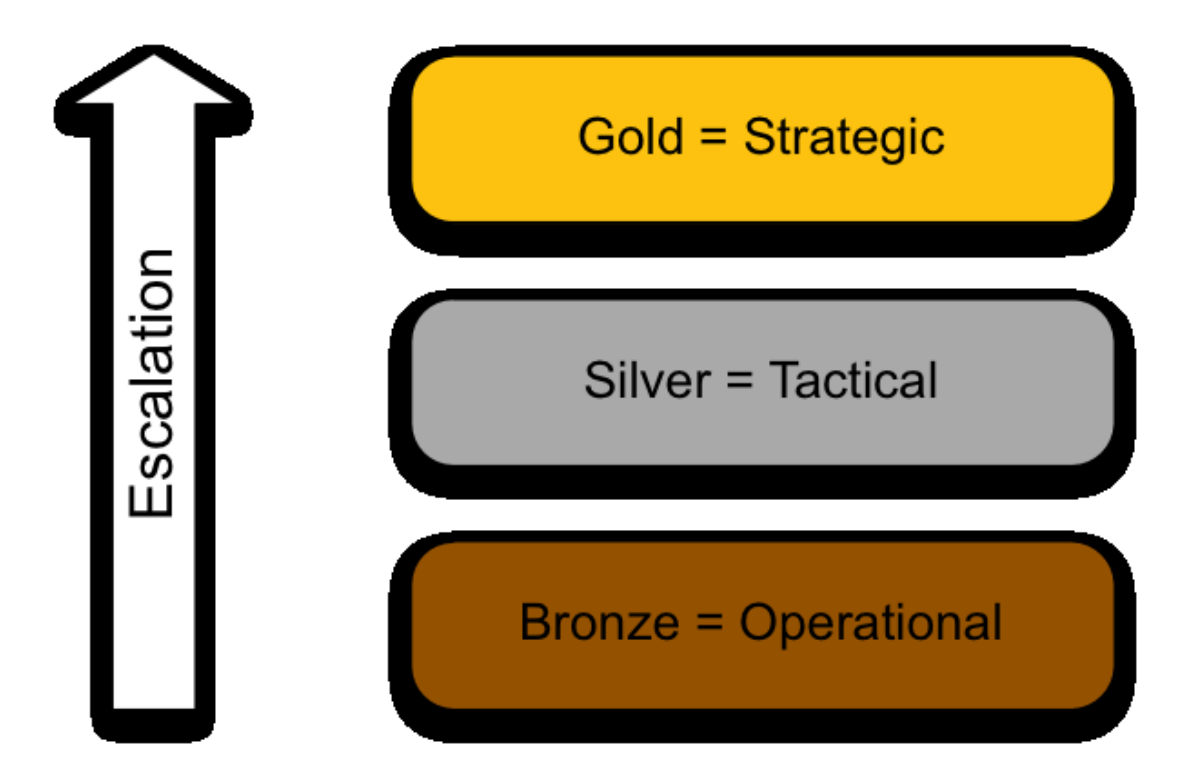
Figure 2: Gold-Silver-Bronze command structure

Gold-Silver-Bronze arrangement within each of the emergency services) allowing for hierarchical decision making within each emergency service. The concept is that the top tier of command within each emergency service can liaise with the others for a co-ordinated response — but this does create tensions in decision-making, with differing priorities and requirements from each organisation. An additional problem can arise when an executive decision maker (such as a government minister) interfaces at the Gold command level, and this can interfere with the standard approach.