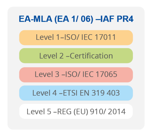
Figure 1: The EA recommended eIDAS CAB accreditation scheme

As illustrated in Figure 1, the eIDAS accreditation scheme recommended by EA requires: