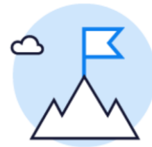
Simple certificate ownership