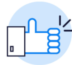
Easy deployment for end users