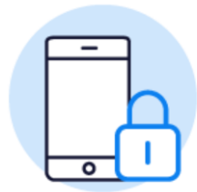
Secure transactions, on the go