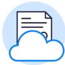
Cloud storage, no download