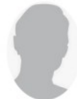
4th ACAB'c A-member representative (ongoing application) XXXXXX