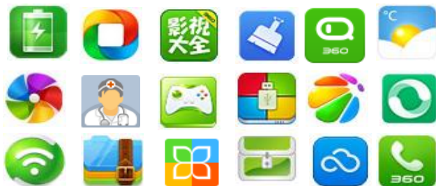
PC and Mobile Footprints