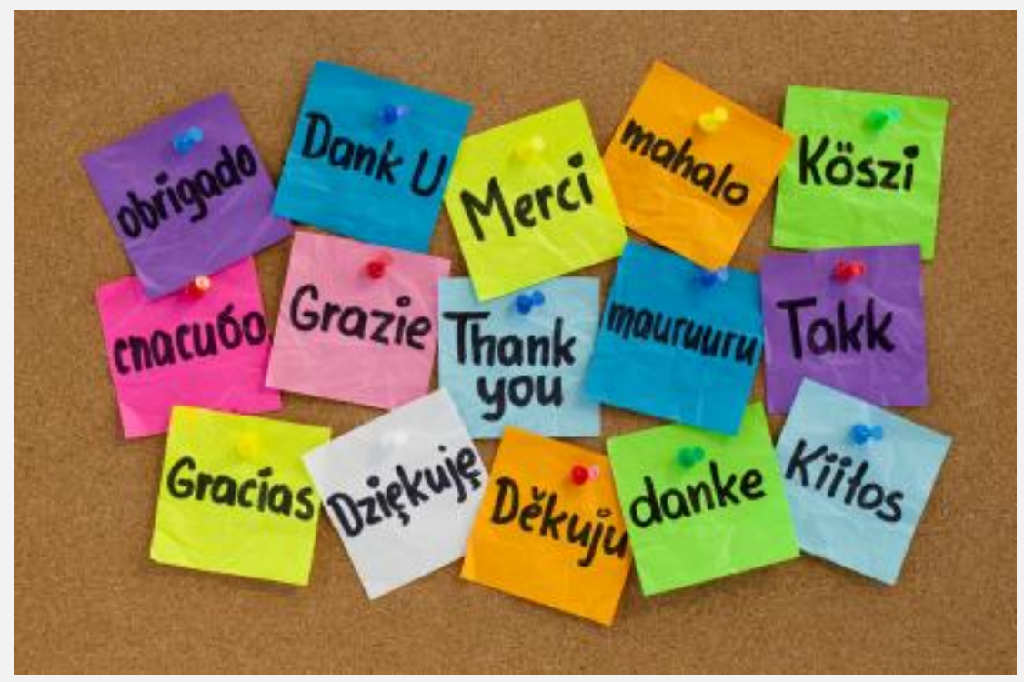
This Photo is licensed under CC BY-SA-NC