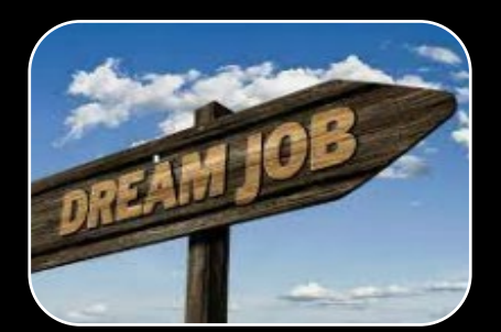
Create more cybersecurity positions (intern & extern) and offer competitive salaries and benefits