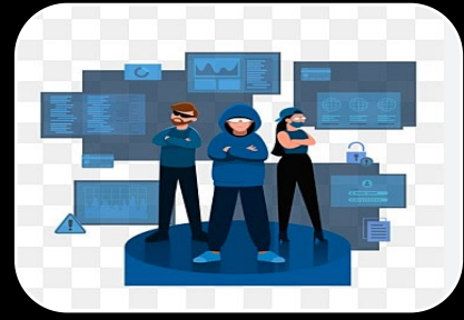
Create a culture of cybersecurity - involve everyone and designate security ambassadors