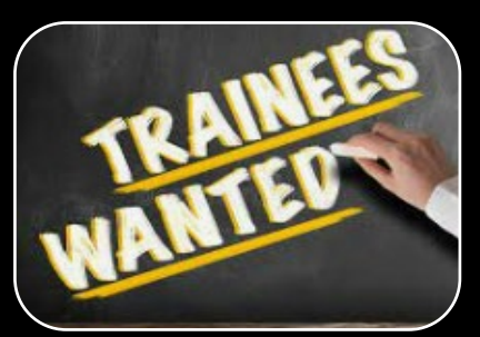
Work with cybersecurity schools (trainees)