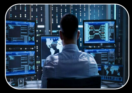
Improve worksforce (ie: CERT for hospitals)