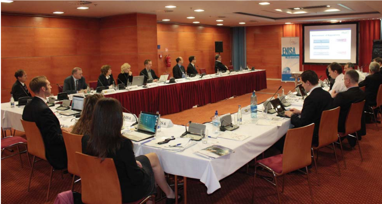
The National Liaison Officers' Network